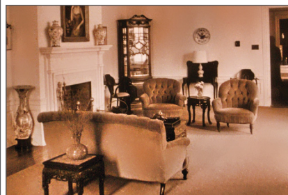
This mahogany curio cabinet (left) once graced the Uplands' drawing room (right images) and is now housed at the Garrett-Jacobs Mansion.