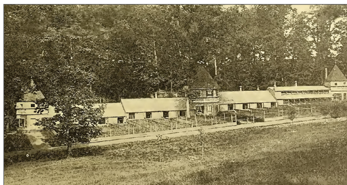
The poultry house at Uplands.