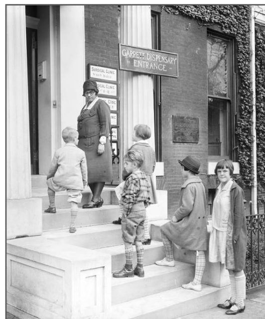
Woman and children entering Robert Garrett Hospital for Children, Baltimore, Maryland, 1905-1940. Digital positive from glass negative.

Over the years, the hospital staff kept excellent records, usually reporting annually in the newspaper on the number of children treated. For instance in 1901 The Baltimore Sun (February, 1) reported that four physicians and surgeons were connected with the hospital