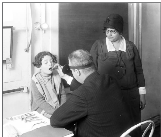
Doctor examining patient at Robert Garrett Hospital for Children, Baltimore, Maryland, 1905-1940.

Seeing a need for a more comprehensive approach to child care, Johns Hopkins sought to enlarge its services to children. A committee of interested citizens was established to develop a plan to do better serve children. This group, including representatives of the