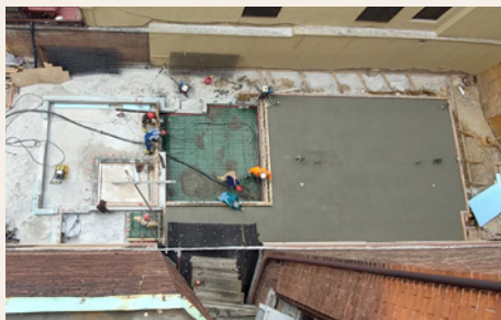
Lower-Level Floor, slab at right has just been poured.