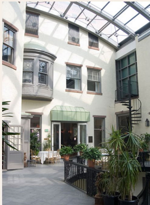
Courtyard for CAB performances

She can be contacted by letter through the address on this newsletter, by e-mail at sabas@outdrs.net , or telephone 540-885-0201.