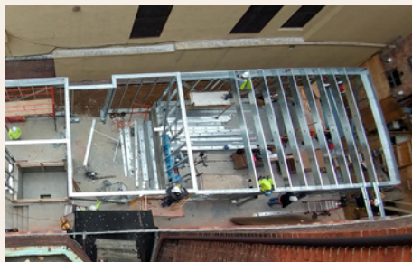
Installation of first-floor light-gage steel framing