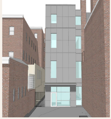
View From Peabody Mews