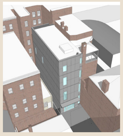
Aerial View of Vertical Addition

Construction is moving forward. Kimball Construction has been hired as the general contractor along with M. Nelson Barnes Company to provide mechanical and plumbing. structure adds approximately 6,000 square feet by expansion of the building's footprint to include elevator access to all floors; provide well-appointed ADA-compliant restroom facilities replacing two of the four current restrooms; add permanent emergency egress stairs including a new secondary entrance/exit for the building, and additional meeting space.