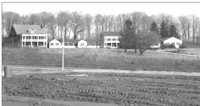
Buildings in Eudowood Sanatorium complex prior to demolition, 1960.