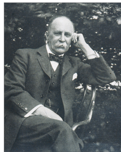
Sir William Osler