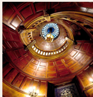
Spiral stairway to Tiffany dome

careful consideration, volunteer Club members and contractors developed a plan to conceal equipment and ductwork to provide air-conditioning for that area. Supply air outlets were designed carefully and installed in the Foyer's walls. It takes a very sharp eye to locate and identify these air outlets. Will you find them? Another unusual detail of the Foyer air-conditioning system is the return air path to the HVAC unit located in a third-floor storage room. For this requirement, the circular stairway was used to provide for a return air path. Returned air travels up the circular stairway and through the slots of the large Tiffany dome at the stairway's top. Above the dome is a glass skylight enclosure. The return air is circulated through this enclosed area providing some ventilation and air circulation above the dome doing double duty to protect this Tiffany treasure.