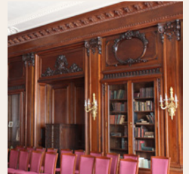
Library wood paneling

much closer in the Marble Hall because the sprinklers were concealed in the round plaster cornice detail material near the ceiling line. The Library project included an upgrade of the wiring systems for the receptacles and lighting throughout that area. The electric and lighting upgrades included power into each of the glass-front bookcases. Attention is now given to installing high-efficiency LED lights in each of the bookcases providing illumination for each individual book & display case and lighting for the Library. The lighting upgrades will be a significant improvement to the overall Library experience.