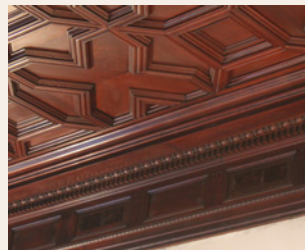
Foyer HVAC vents

The start of the wave to improve the building's systems was the "Boiler Blast" project in 1998