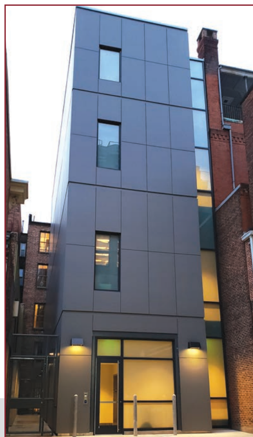
New Tower Project features a new elevator and enhanced fire safety