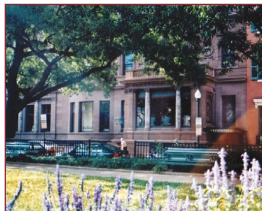
The Garrett-Jacobs Mansion incorporates 7, 9, and 11 West Mount Vernon Place