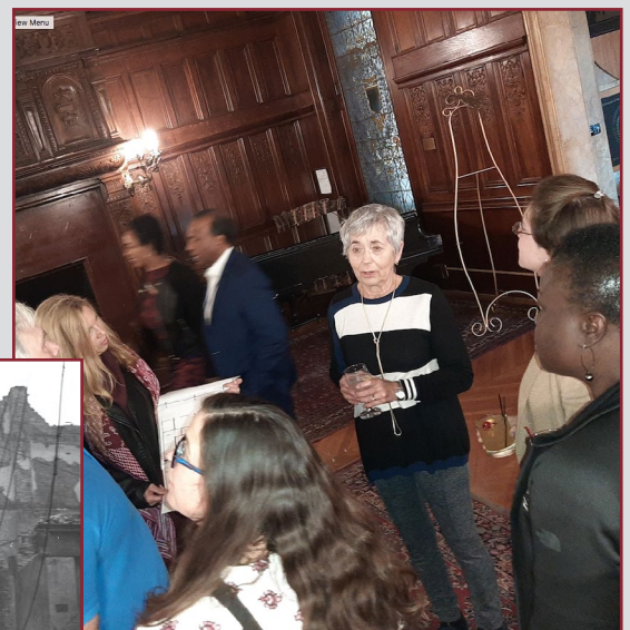
Our inaugural season of Taste & Tour drew over 120 participants, who learned about how the history of the Garrett family and the architecture of the Mansion are emblematic of the United States during the Gilded Age, while enjoying the evening's signature cocktail.