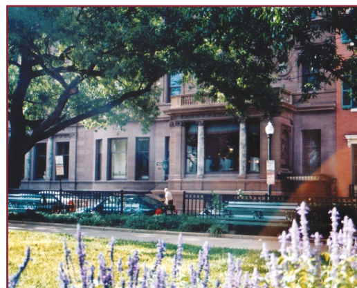
The Garrett-Jacobs Mansion incorporates 7, 9, and 11 West Mount Vernon Place