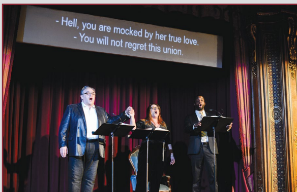
Baltimore Concert Opera entertained 2,250 opera enthusiasts at twelve performances that included the popular "Thirsty Thursday," held in the Mansion's ballroom.