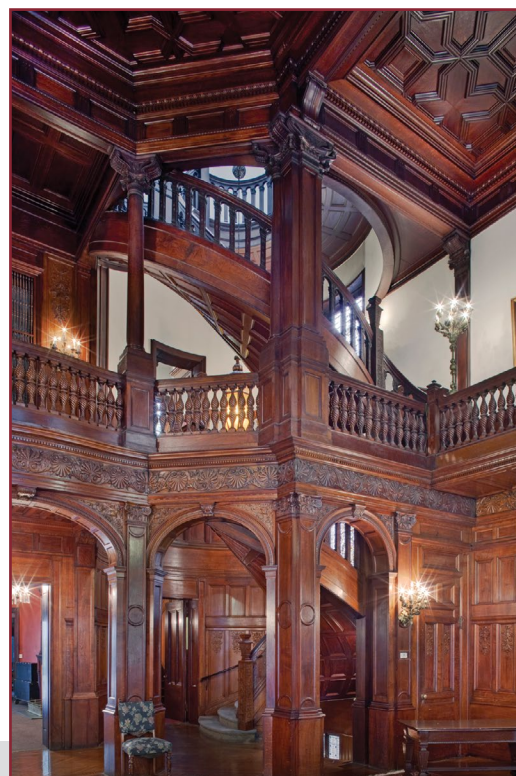
The Mansion's spiral staircase was designed by Stanford White.